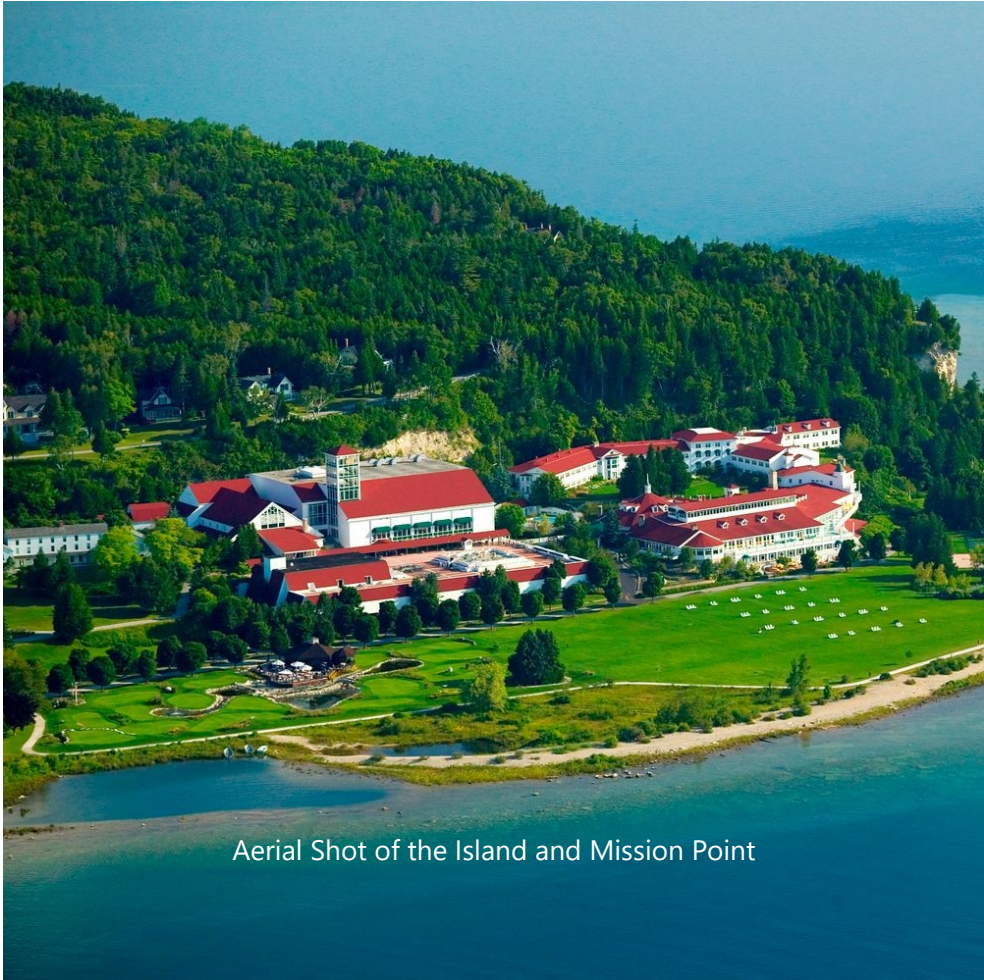
Aerial Shot of the Island and Mission Point

Mackinac Island is Michigan’s #1 tourist destination and at Mission Point, we work hard together and have pride for the island we call home. Mission Point is Mackinac Island’s largest family-owned resort and recruits from all over the world, priding ourselves in a diverse international team. It’s a resort destination that transcends time and is a place so special, you have to take a ferry to get here. Mission Point Resort, located on Mackinac Island, is an award-winning, best-in-class national bucket list destination. Open seasonally from late April through October, Mission Point is visited by thousands of guests each season, providing extraordinary Mackinac Island experiences to all who visit our hotel, shops, restaurants, activities and events. If you are looking for a culture where you make a difference and are truly part of a successful team, then Mission Point is the place for you.