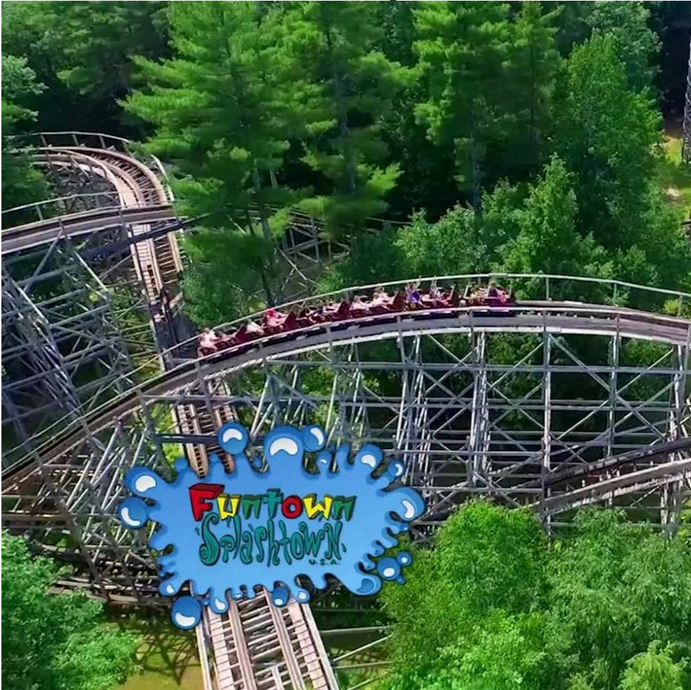
Food and Beverage at an Amusement and Water Park in Saco, Maine.