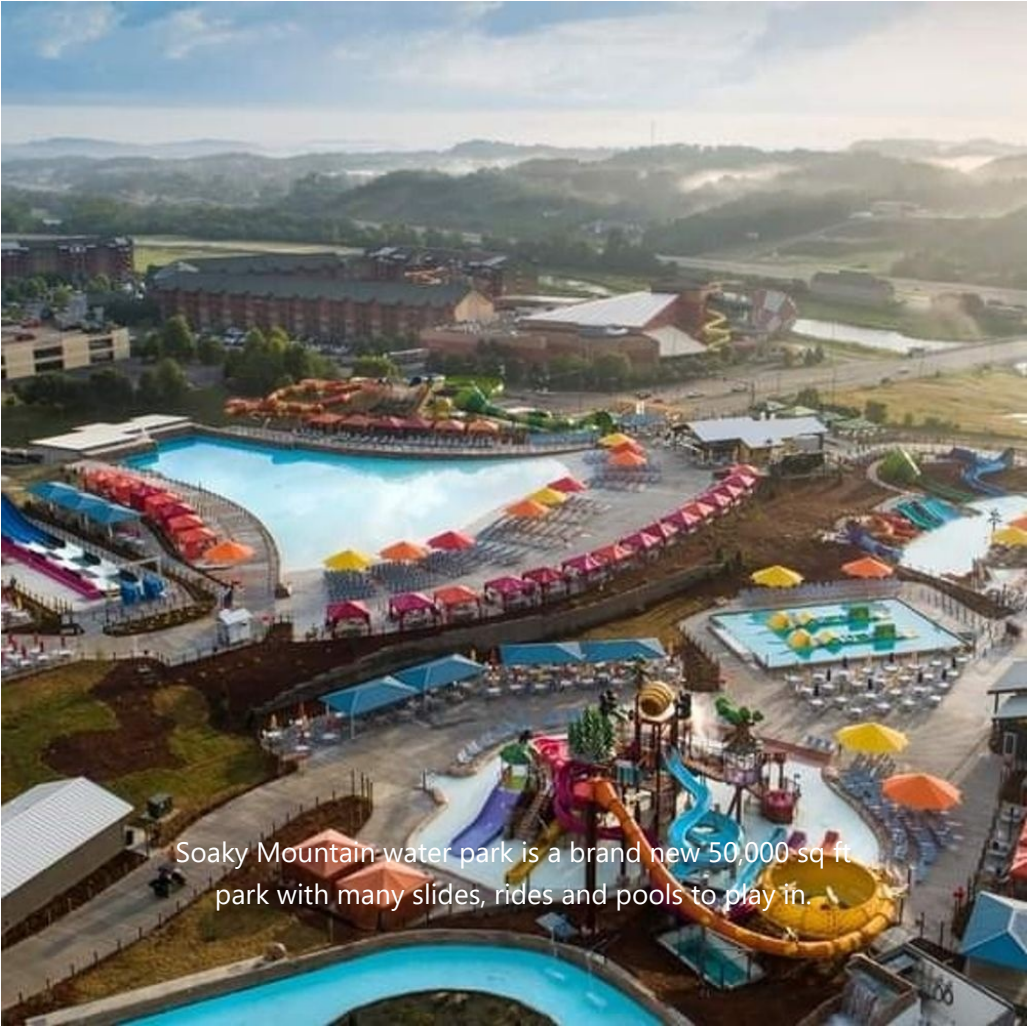
Soaky Mountain water park is a brand new 50,000 sq ft park with many slides, rides and pools to play in.