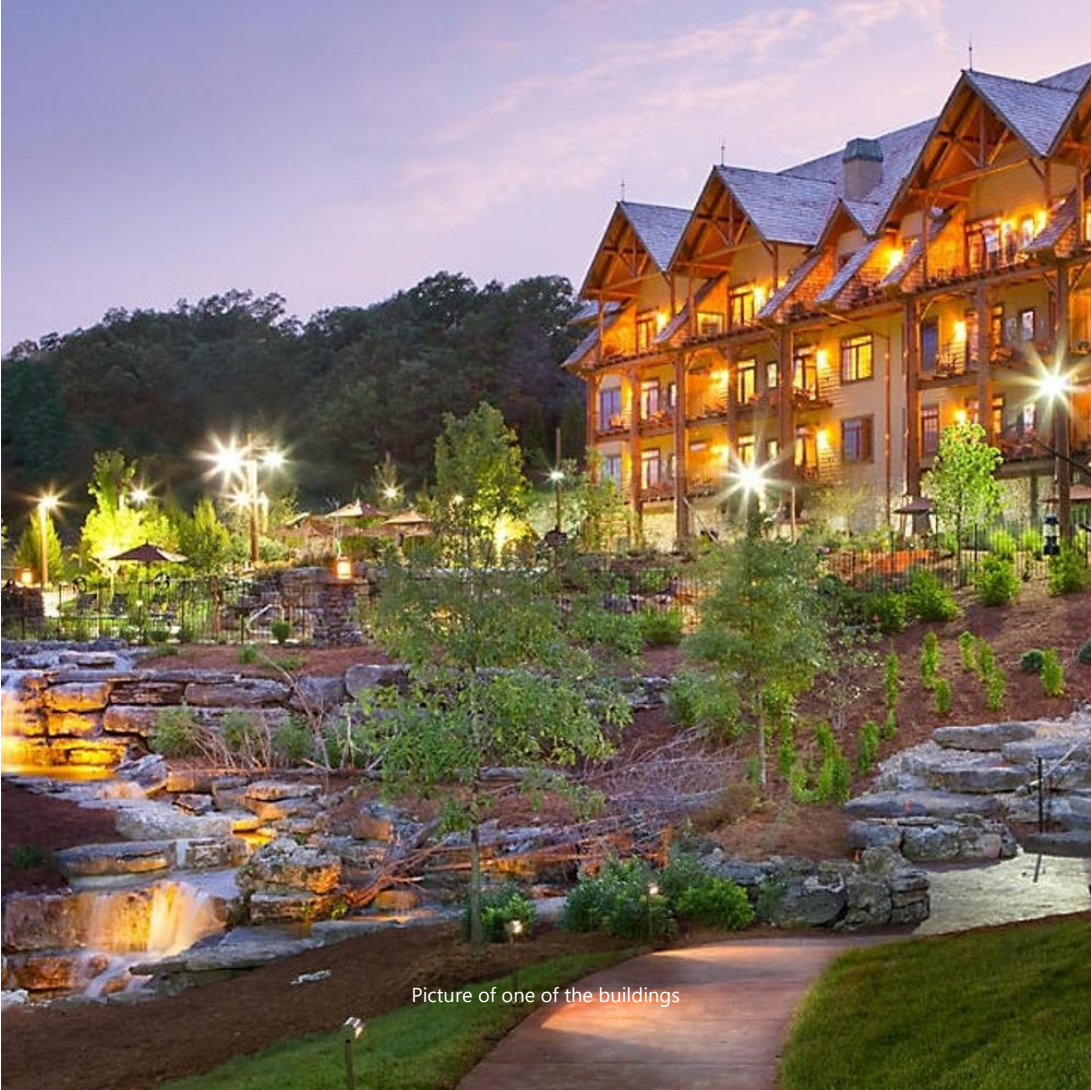
Picture of one of the buildings

Established in 1966, Patten Realty, Inc. was a land management company that was later renamed Bluegreen Vacations®. Since that time, Bluegreen has grown to become a leader in vacation ownership. Our 220,000+ owners and their guests enjoy vacation experiences across a range of exciting destinations. They relax in style at unique resorts featuring spacious accommodations with all the comforts of home, plus vacation-enhancing amenities and a staff dedicated to making every stay a memorable one.